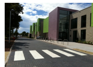
Our purpose built Centre at the Hereford Academy

Welcome to Community Learning at the Hereford Academy. We offer adult and family learning activities during the day-time, evenings and weekends in our own dedicated area within the new Academy building.