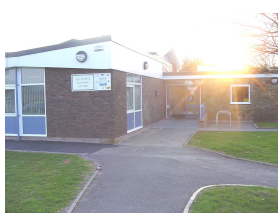
Our purpose built Centre at the Hereford Academy

Welcome to the Hereford Academy Community Learning Centre, an adult learning centre based in the Oak Centre at the Hereford Academy. Formerly known as the South Wye Learning Centre, the Community